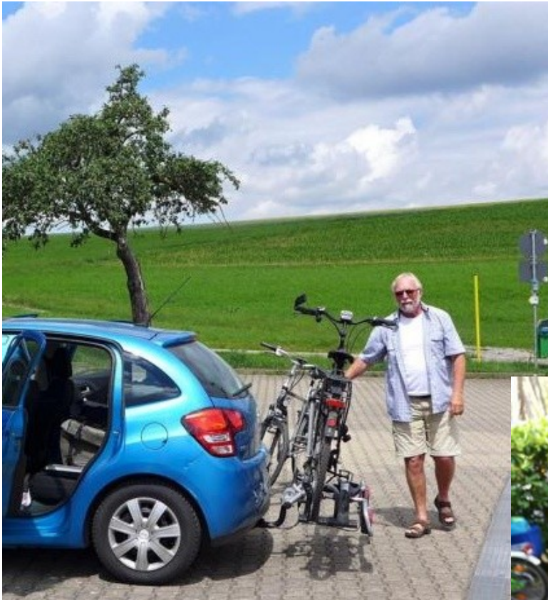
Bicycle excursion in the nature park Schwäbisch Fränkischer Wald.