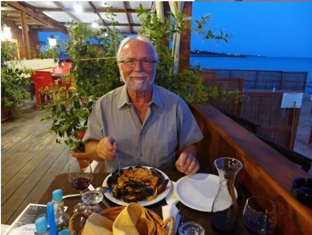
Frutti di Mare at the beach restaurant in Punta Braccetto.