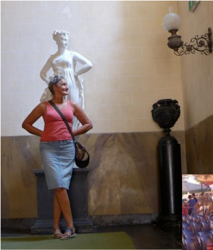
Two graces in the stairwell of the Villa Donna Fugata in Sicily.