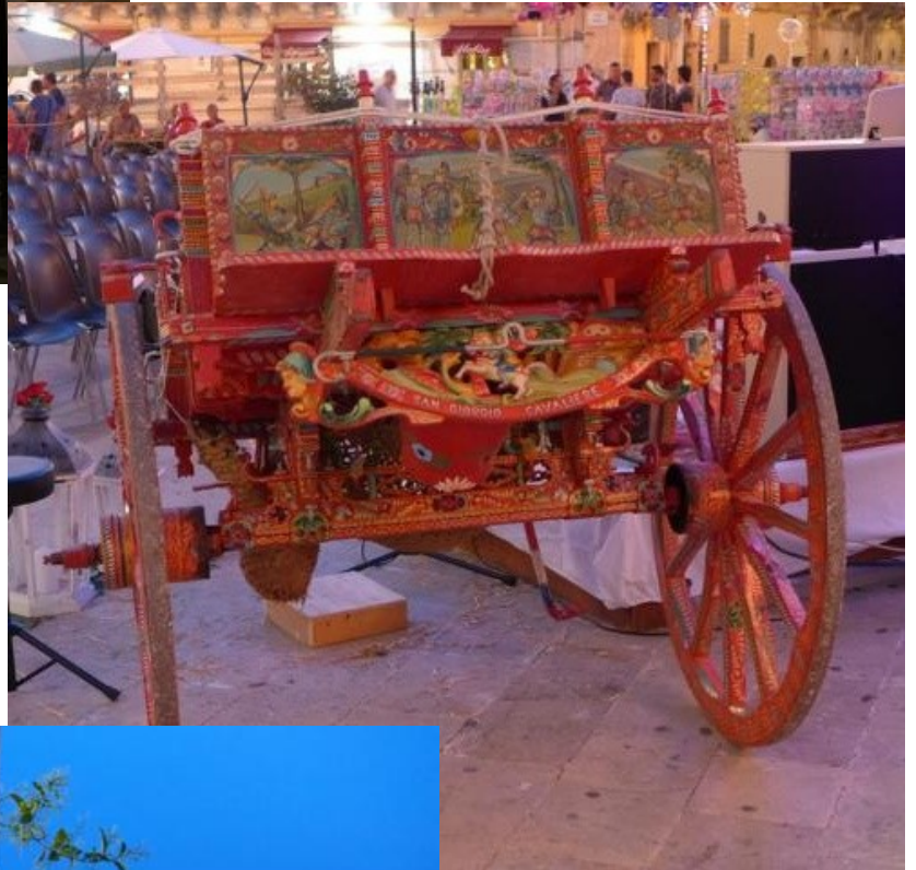
Historic mule car lovingly decorated.